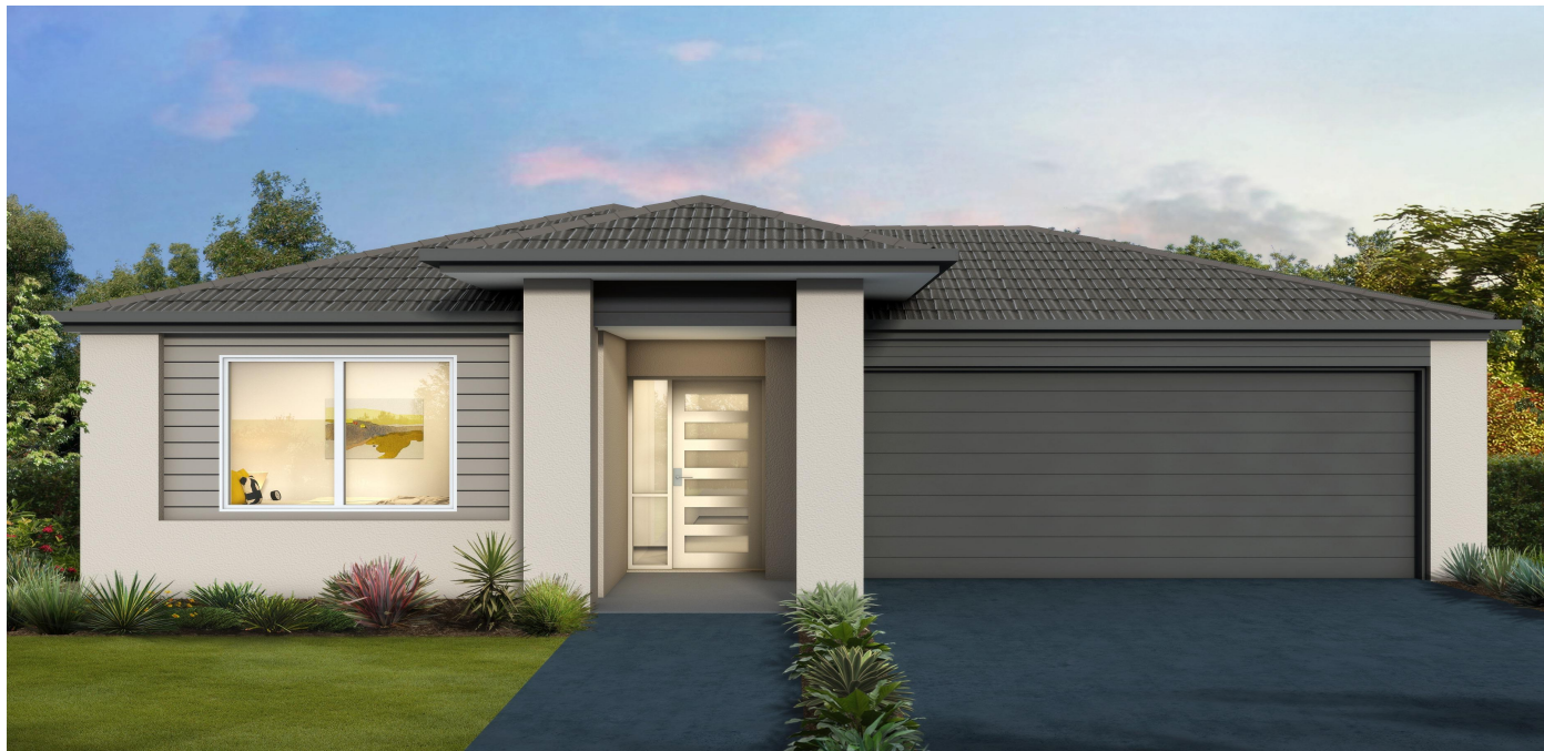
Plans override the source image as these are an artist impression only