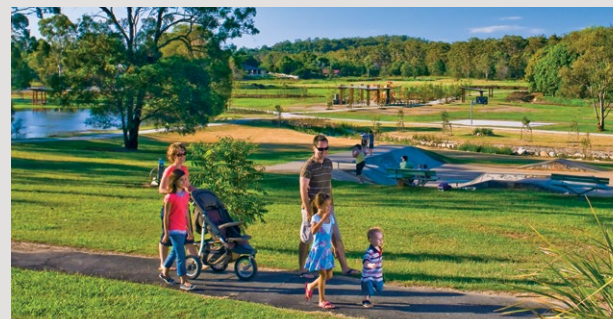
Feel welcome and part of our community