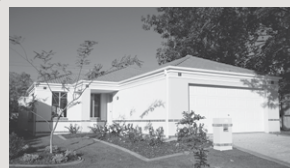
Quality craftsmanship, design innovation and enduring relationships