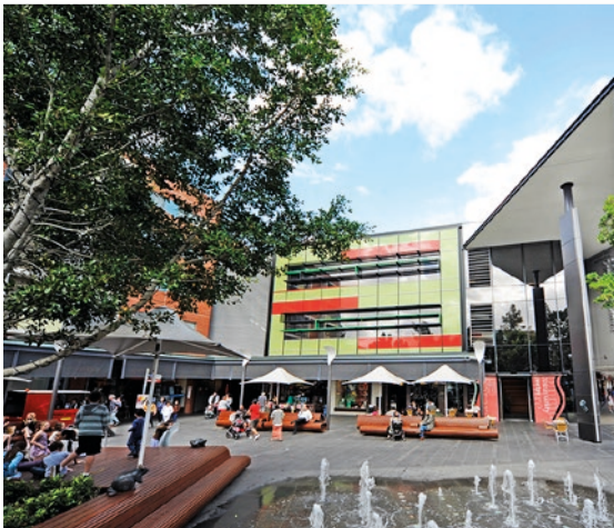
ROUSE HILL TOWN CENTRE