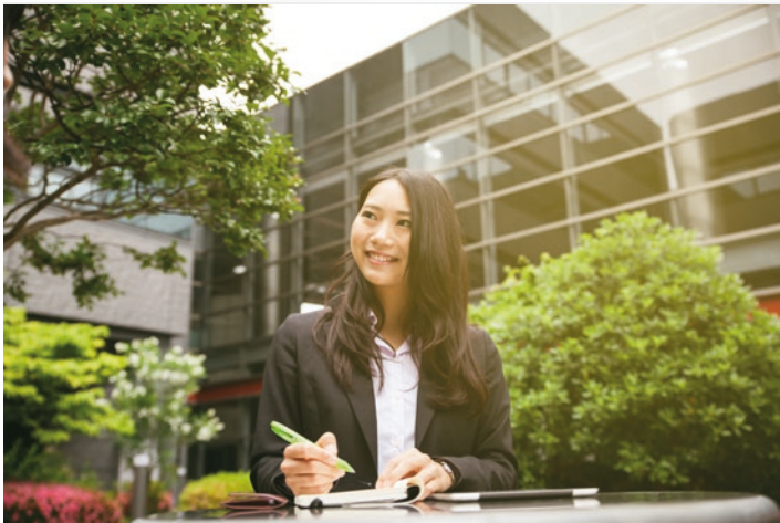
NORWEST BUSINESS PARK