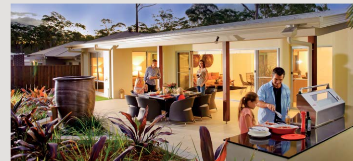
More than 40,000 Australians call a Villa World address, home