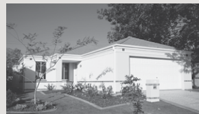
Quality craftsmanship, design innovation and enduring relationships