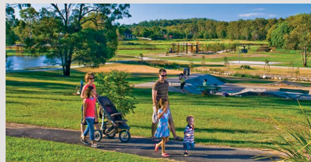
Feel welcome and part of our community