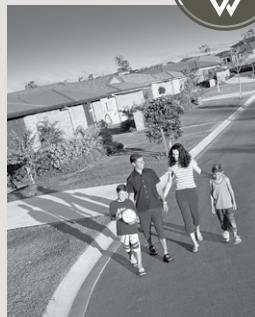
Master planned communities since 1986