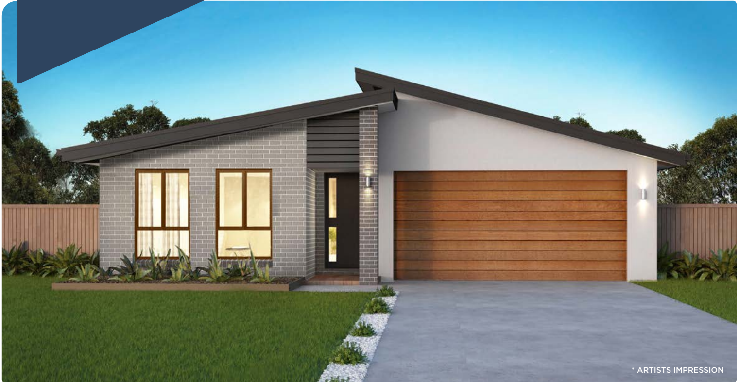
* ARTISTS IMPRESSION