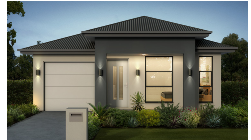
FACADE UPGRADE - CONTEMPORARY