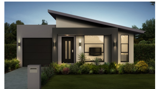
FACADE UPGRADE - VOGUE