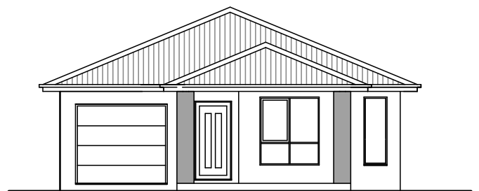
CLASSIC FACADE - TRADITIONAL 2