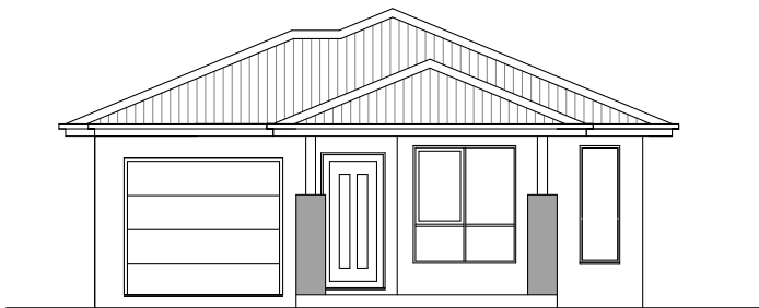
CLASSIC FACADE - TRADITIONAL 1