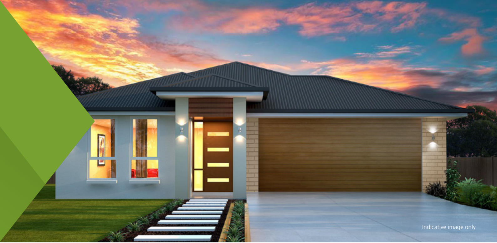
Indicative image only