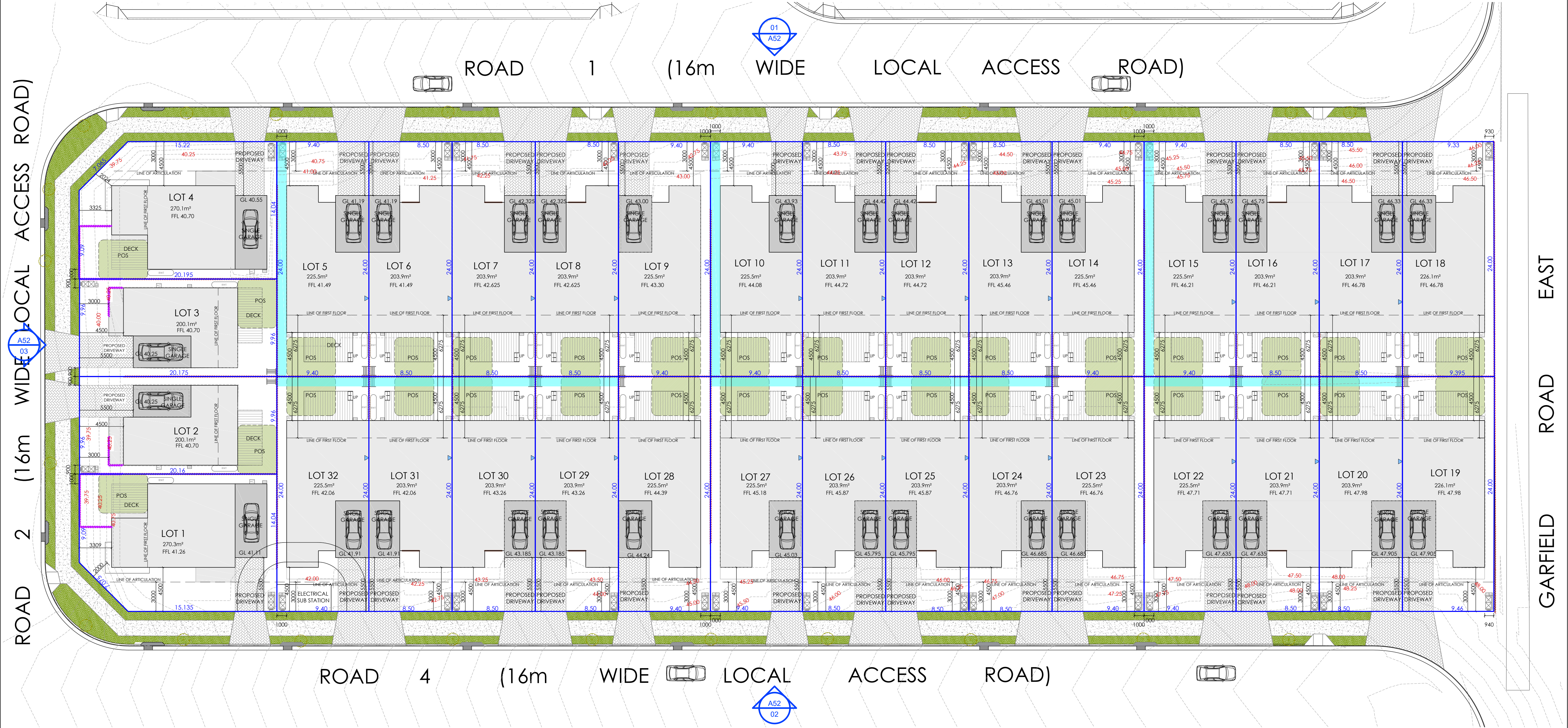
SITE PLAN 1:200 @ A1