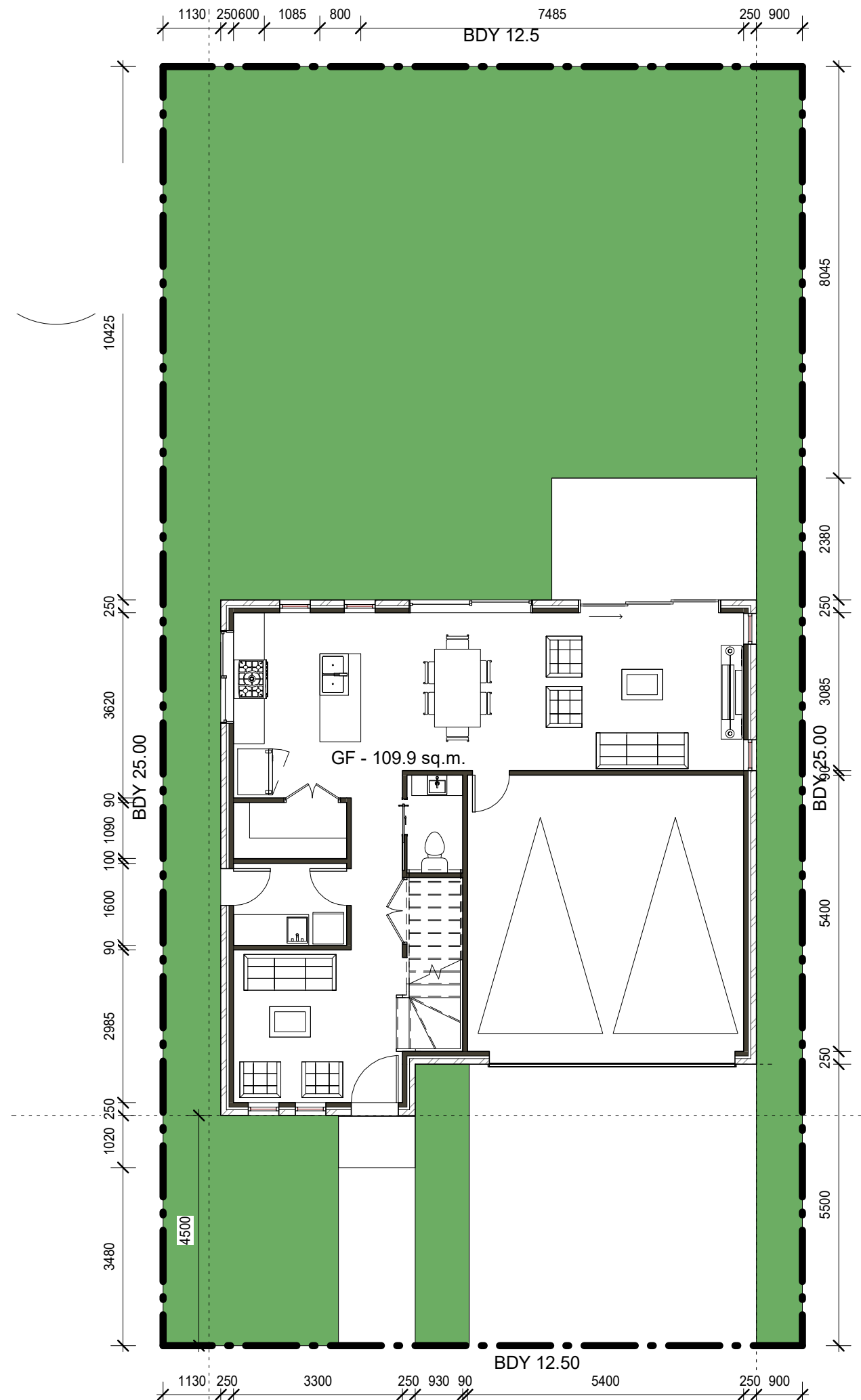
1 Ground Floor 1 : 100