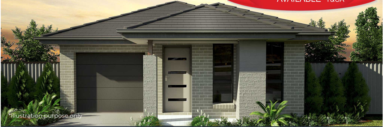
Illustration purpose only

$10,000 FIRST HOME DEVELOPER REBATE AVAILABLE T&CA