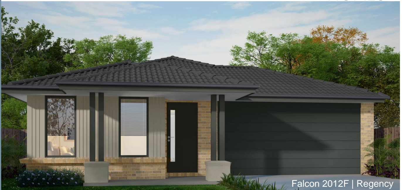
Falcon 2012F | Regency

Lot 127 Tindari Way Wollert (Stonefield)