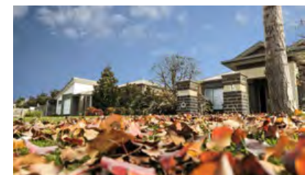
Parklife - Traralgon