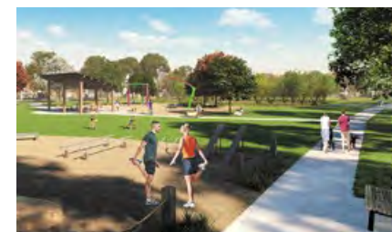
Alfredton Grove - Ballarat